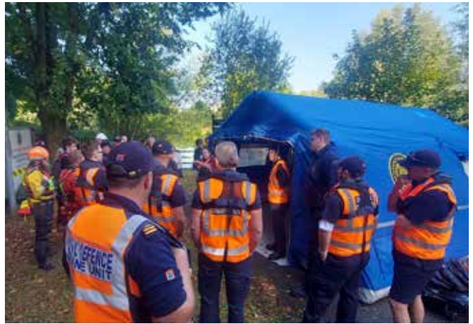
▲ Kilkenny sonar exercise

A number of units have the M30T craft which can operate in wind and rain. This has now been discontinued and we will be running a procurement exercise to source the next iteration, for units who are newly registered with the Irish Aviation Authority.