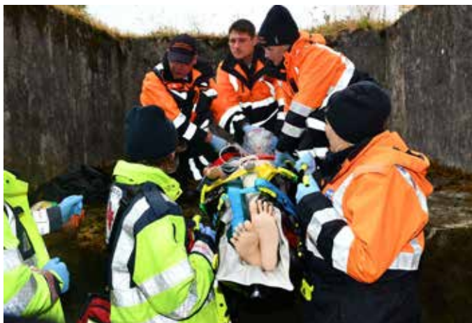
▲ Bere Island EMT Weekend