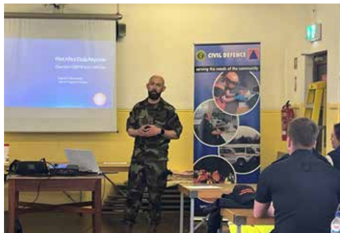
▲ Medical Director Bere Island EMT Weekend