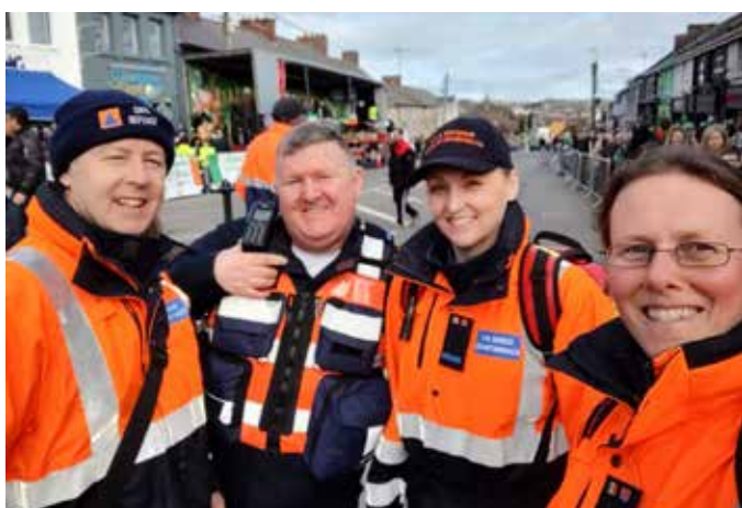
▲ Wexford St Patricks Day