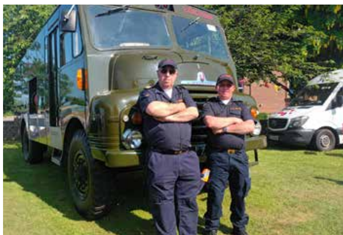
▲ Malahide Vintage Show