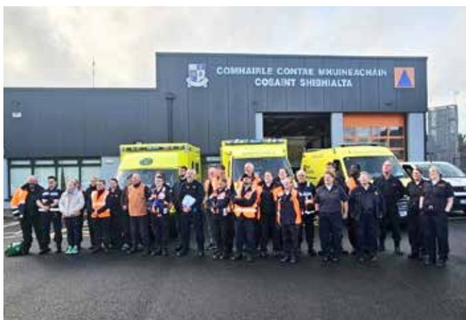
▲ Monaghan First Aid Exercise