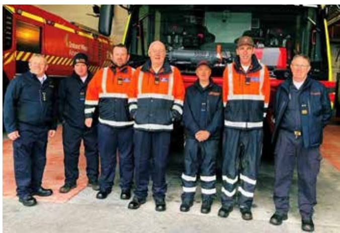
▲ Mayo at Ireland West Charity Fundraiser