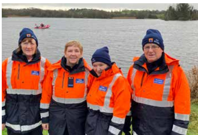
▲ Xmas Swim, Lavey