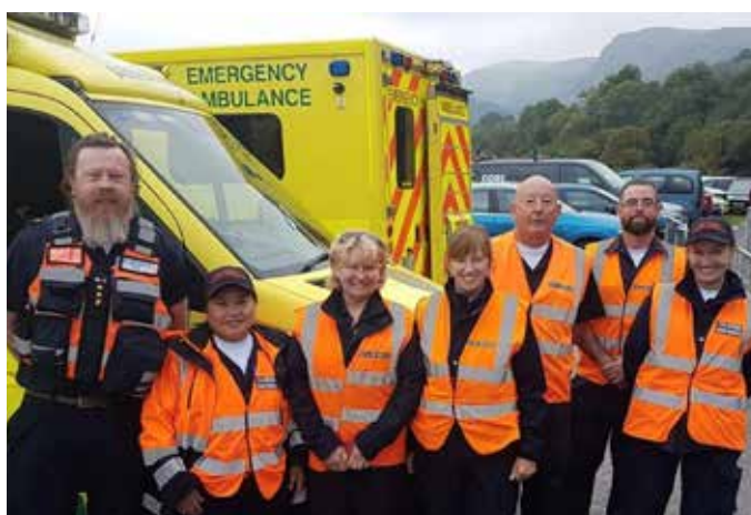
▲ Sligo Medical Response at Glencar Lough Swim