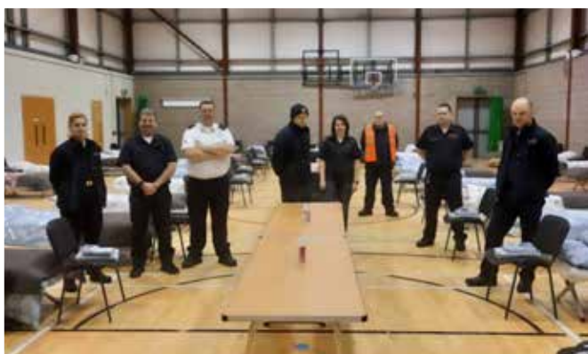
Littleton Rest Centre, Tipperary