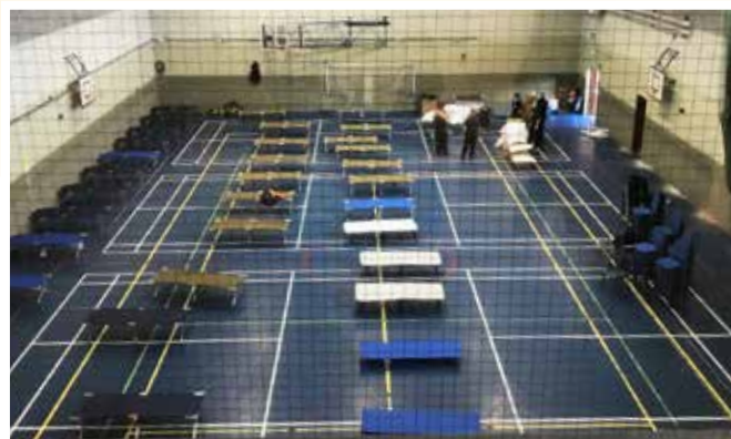
Cavan Rest Centre Set Up