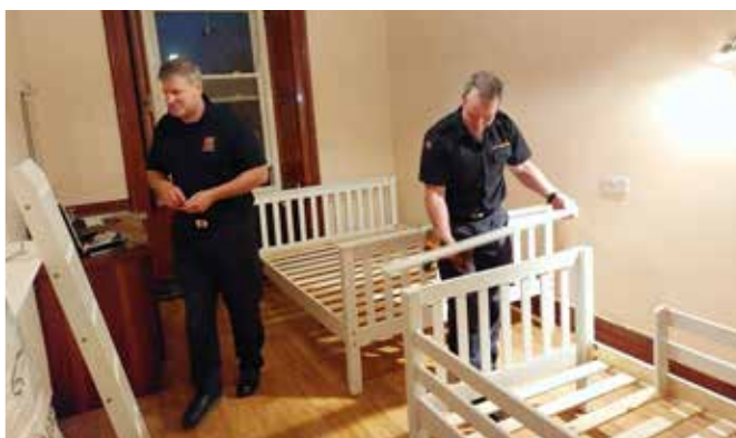
Kilkenny Ukrainian support