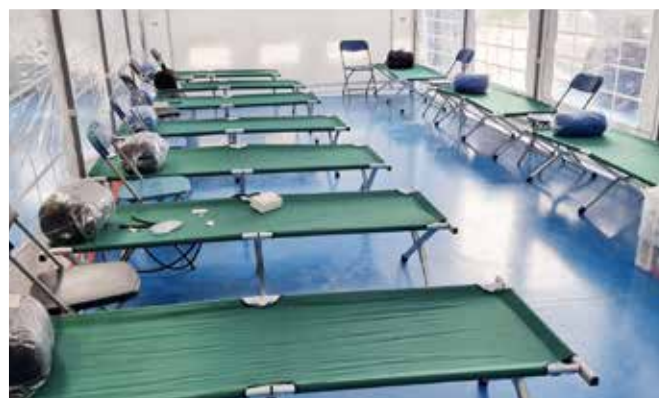
Meath Temporary Rest Centre