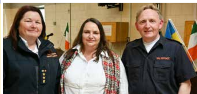
Ukrainian Ambassador Visits Limerick