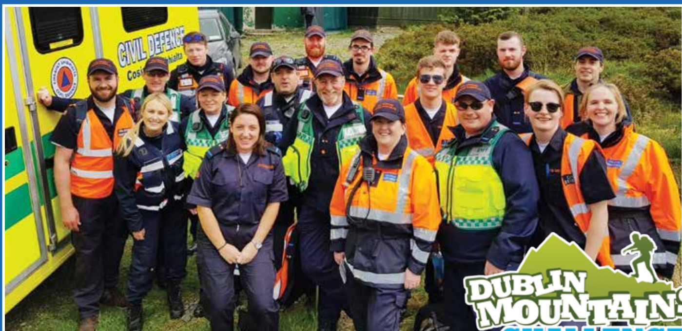
Barretstown Mountain Challenge

New Members are always welcome. Enrolment enquiries may be made through your local Civil Defence Officer. Contact details are on our website