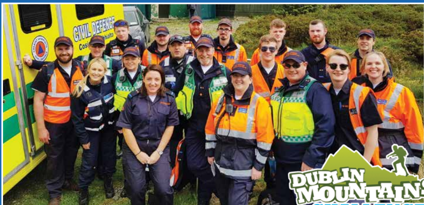
Barretstown Mountain Challenge

New Members are always welcome. Enrolment enquiries may be made through your local Civil Defence Officer. Contact details are on our website