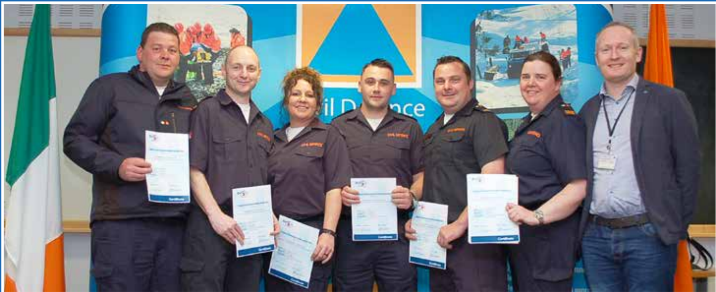
Graduation Ceremony, May 2019 Civil Defence College