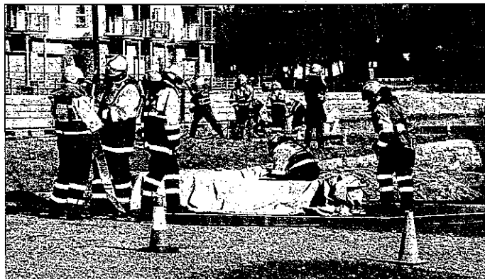
Civil Defence Volunteers prepare for a series of training exercises at the Canal Basin in Tralee on Saturday afternoon.