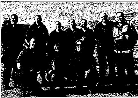
Volunteers from the Kerry Civil Defence team who took part in the Munster Civil Defence training exercises in Tralee on Saturday.