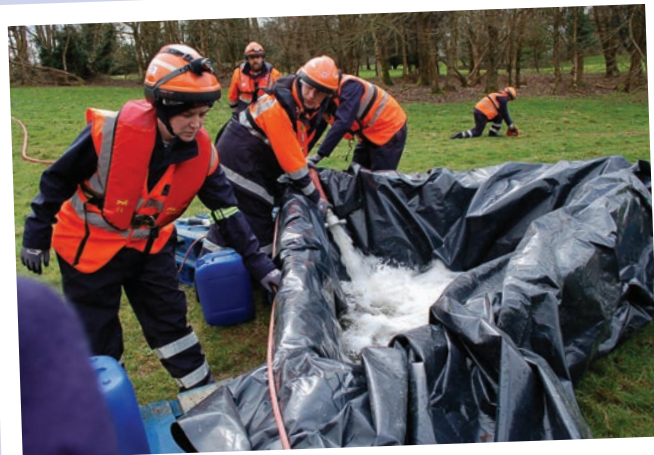
Regional Exercise Cork South (Water Pumping)