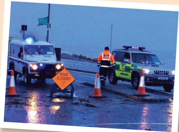
Flood Relief – Road Traffic Control, Waterford