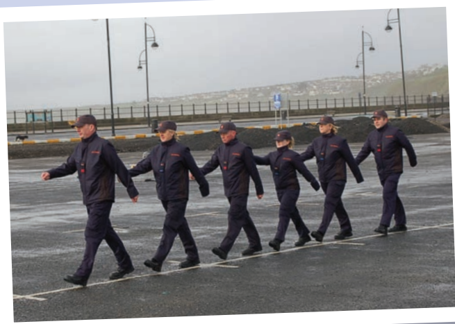
Regional Exercise, Waterford (Footdrill)