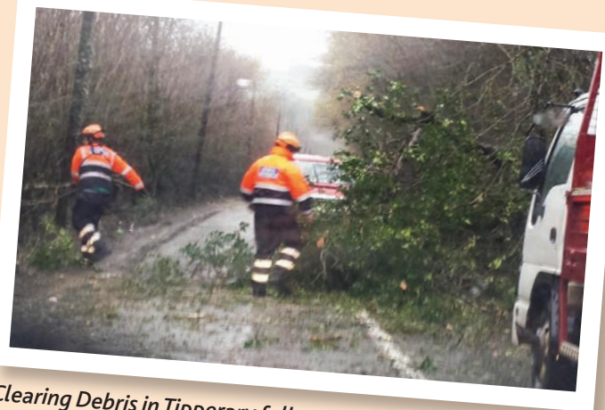
Clearing Debris in Tipperary following Hurricane Darwin