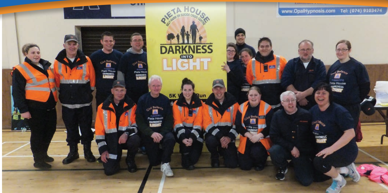
Darkness into Light for Pieta House - Donegal