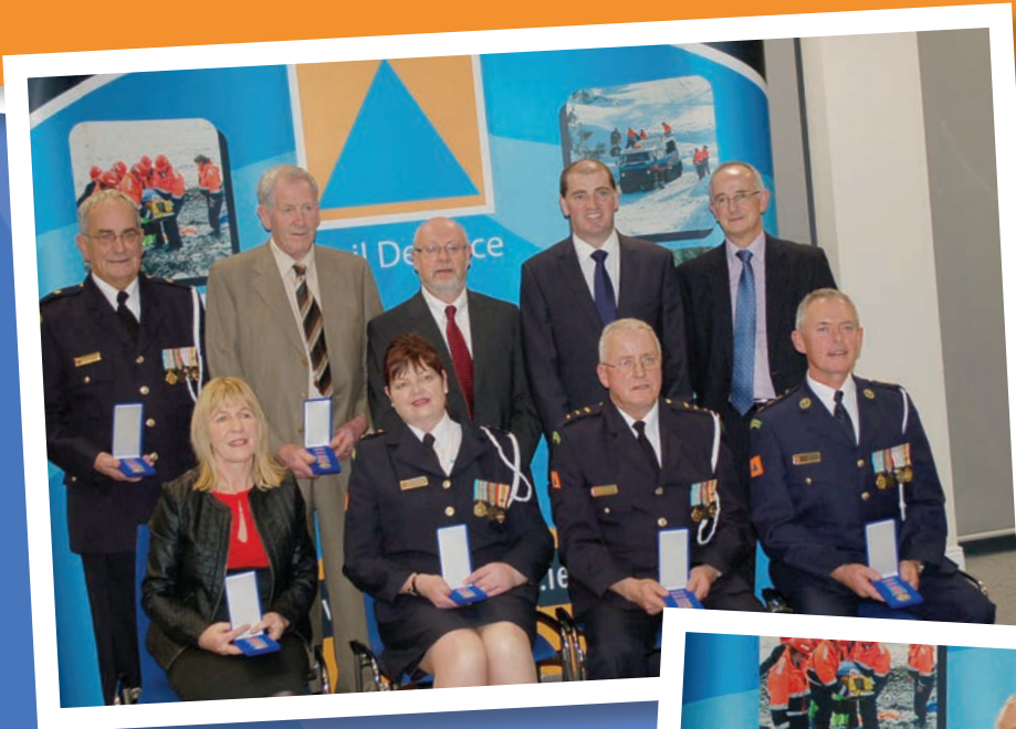
Westmeath Medal Recipients