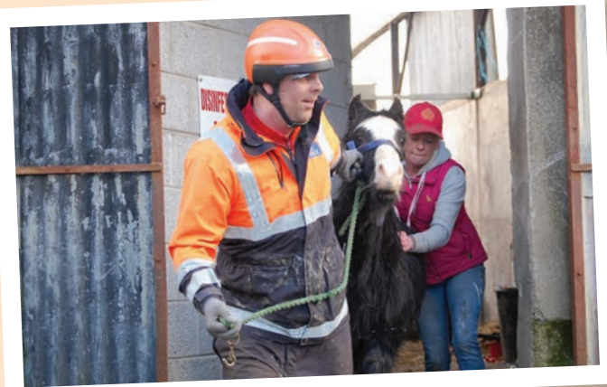
Moving animals to safety, Castleisland Animal Shelter

The tasks undertaken were diverse and numerous, namely, evacuation of people from flooded homes, transportation of evacuees (in 4x4's), water pumping, filling & deployment of sandbags, traffic control, transportation of children to schools, flood barrier erection/ flood defence construction, monitoring of water levels, delivery of safety notices, manning of Command & Control Units, transportation of home help to elderly, transportation of patients from Nursing Homes, removal of fallen trees and debris from roads, delivery of essentials to homes without power, supplying clean water to residents without power, attending Crisis Management Team Meetings and bringing animal feed to isolated elderly farmers.