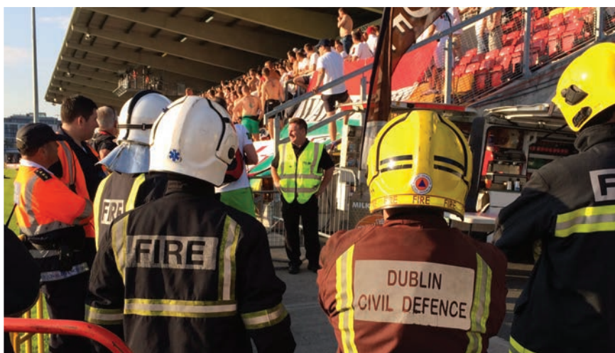
Fire Cover at Champions League Qualifier