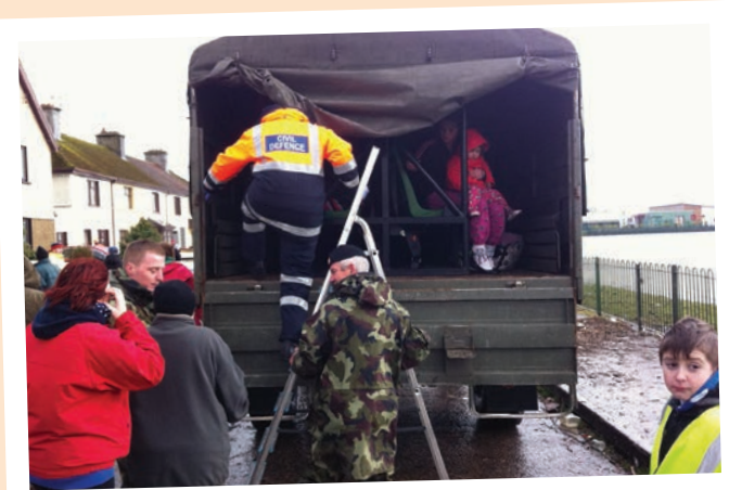
Evacuation of flooded homeowners, Limerick City