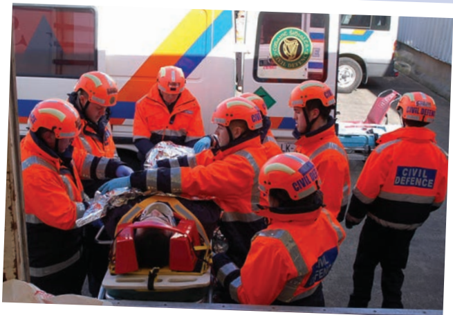
Regional Exercise, Limerick (Casualty)