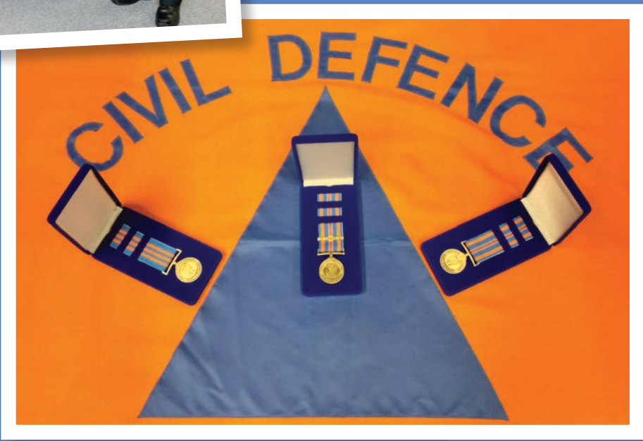
30, 40 and 50 Year Medals