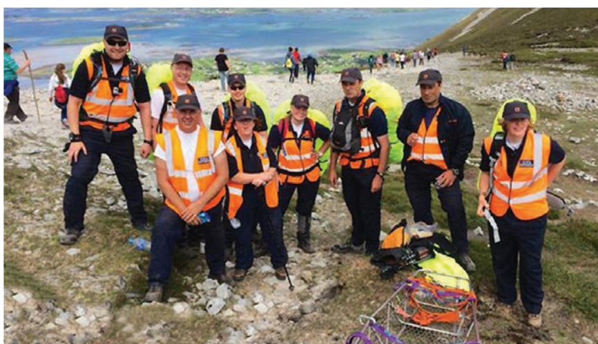
Reek Sunday - Mayo