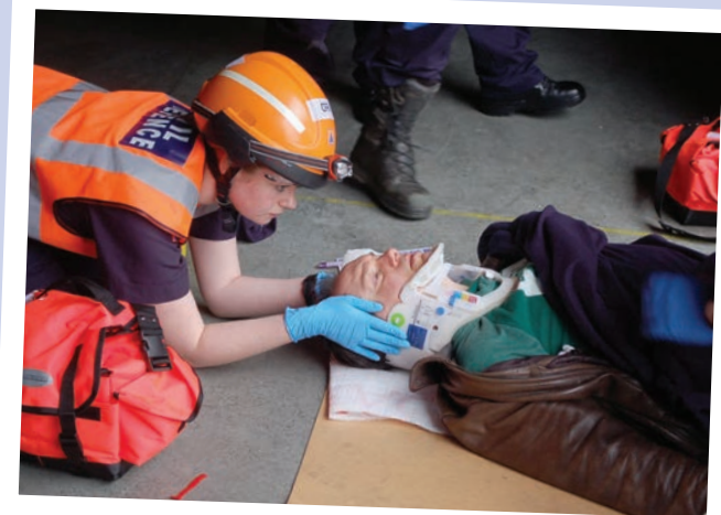
Regional Exercise, Limerick (Casualty)