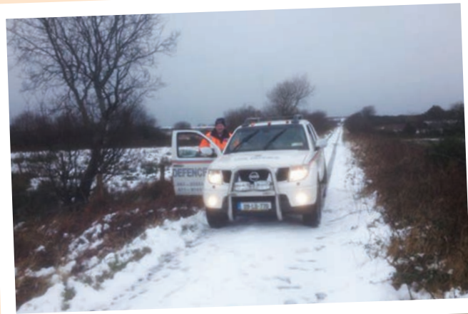
Transporting 'Social Services', Sligo

Civil Defence was deployed to assist the Primary Response Agencies in a total of 35 severe weather relief operations during the course of the year.