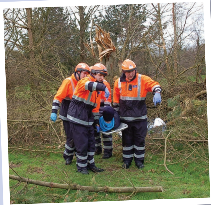
Regional Exercise, Cork South (Search & Recovery)

Each Exercise tested and showcased the capabilities and skills of the participants in a wide range of disciplines under differing weather conditions.