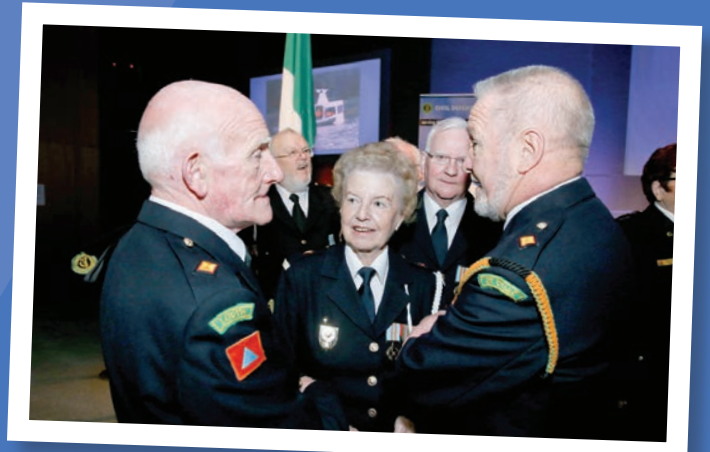
Discussing times past at the Ceremony