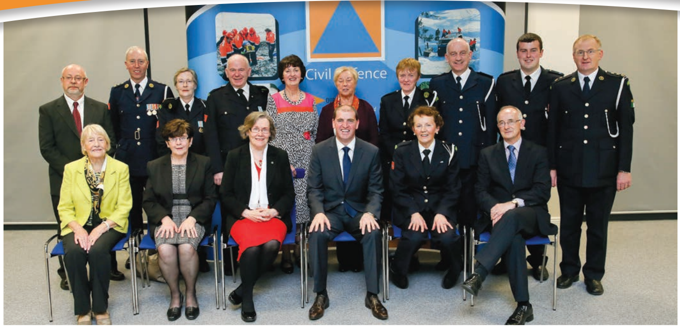
Cavan Medal Recipients