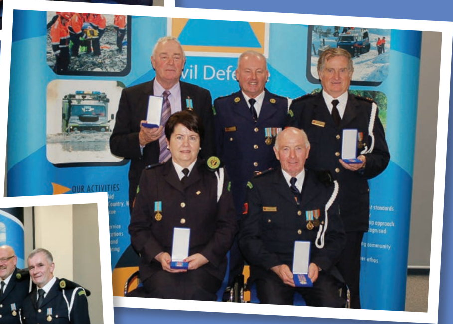
Roscommon Medal Recipients