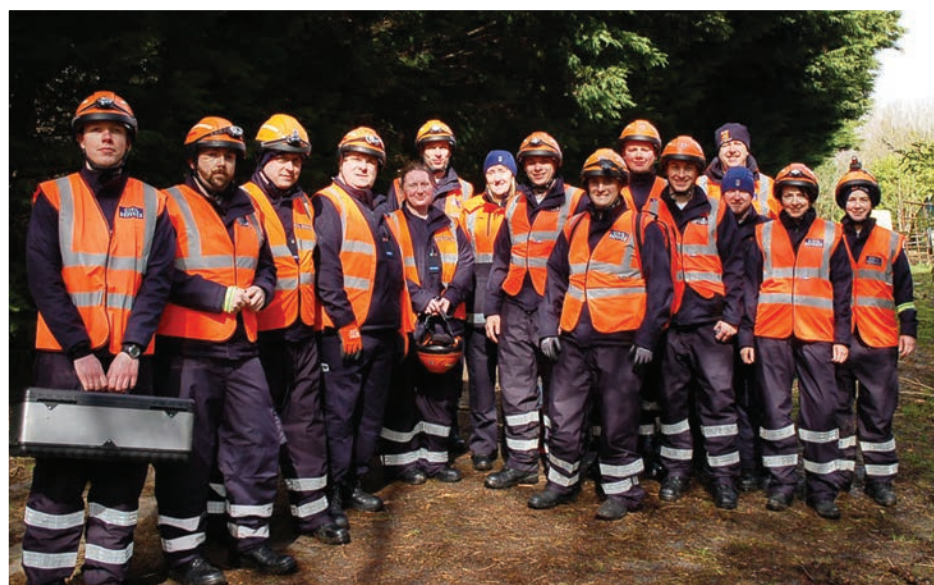
Cork City Volunteers at Regional Exercise

New members are always welcome. Enrolment enquiries may be made through the Local Authority based Civil Defence Officer or via the Civil Defence Website.